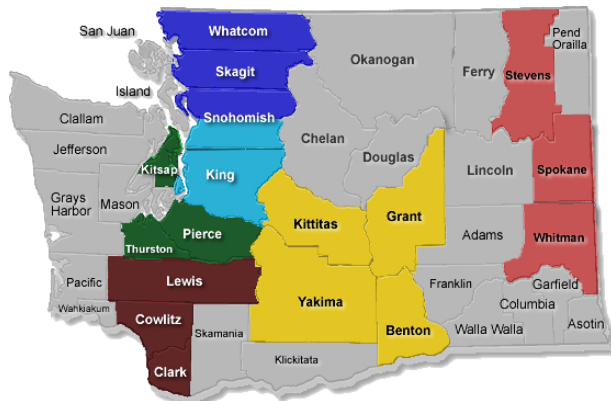
In-Person Pediatric Resource Management Available in Colored Regions

Exceptions may be considered based on caseload.